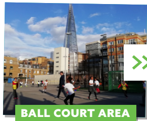
BALL COURT AREA